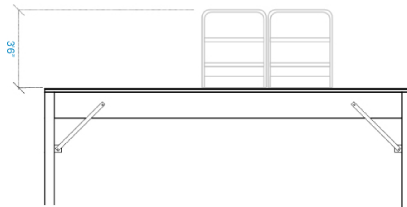
Right Elevation View